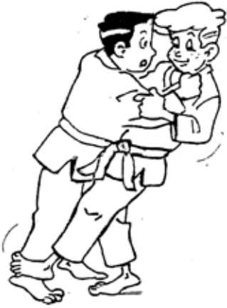
HARAI - TSURI - KOMI - ASHI