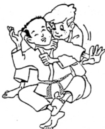
OKURI - ERI - JIME