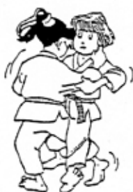
O - UCHI - GARI