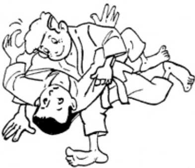
KUZURE - HON - GESA - GATAME