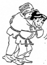
O - GOSHI