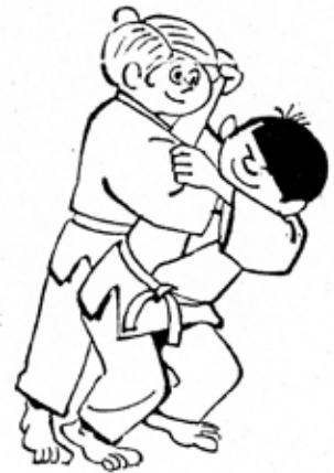
TSURI - KOMI - GOSHI