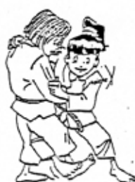
KO - UCHI - GARI