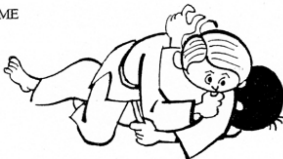
KUZURE - TATE - SHIHO - GATAME