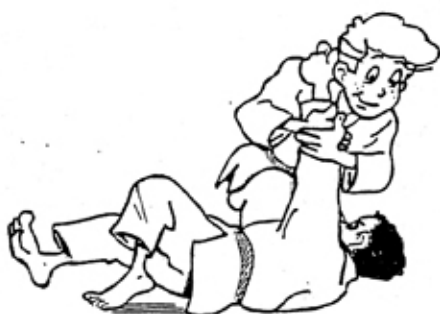
UDE - GATAME