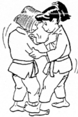
DE - ASHI - BARAI