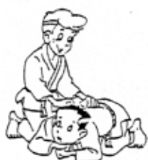
YOKO - SHIHO - GATAME