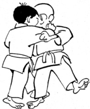
KO - SOTO - GAKE