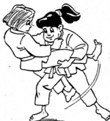
KUCHIKI - DAOSHI