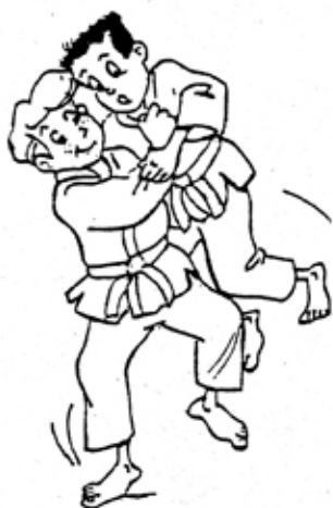
UTSURI - GOSHI