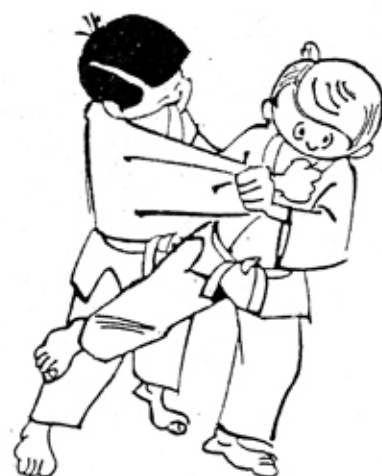
ASHI - GURUMA