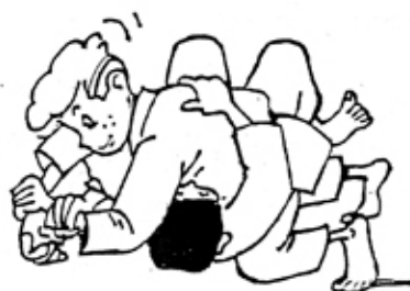
UDE - GARAMI