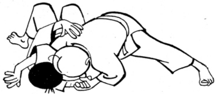
KATA - GATAME