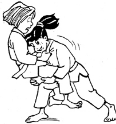
MOROTE - GARI