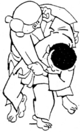
HANE - GOSHI