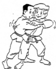
UKI - GOSHI