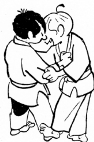
KO - SOTO - GARI