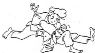
USHIRO - GESA - GATAME