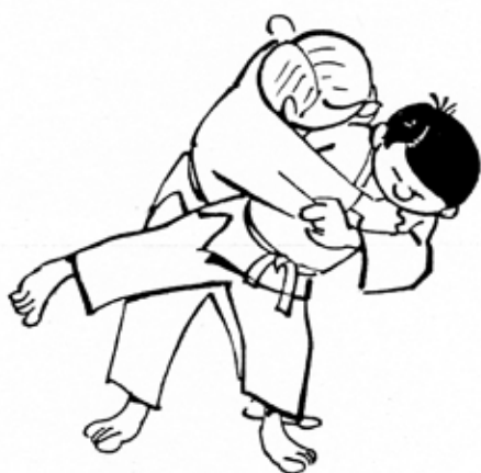
O - GURUMA