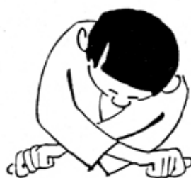
POSITION DES BRAS