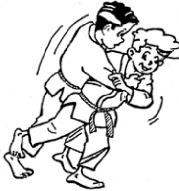
HARAI - GOSHI