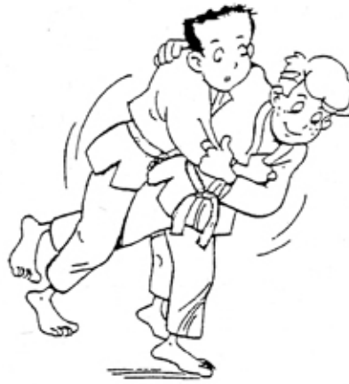
UCHI - MATA