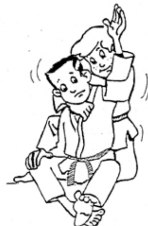
KATA - HA - JIME