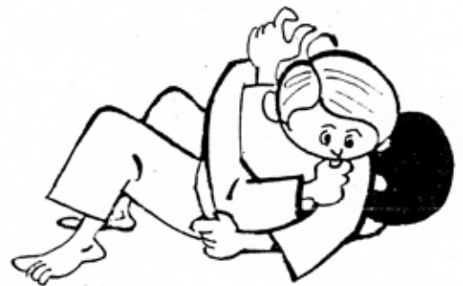
KUZURE - YOKO - SHIHO - GATAME