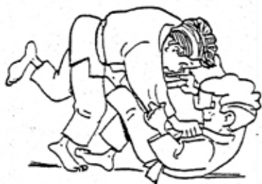
YOKO - TOMOE - NAGE