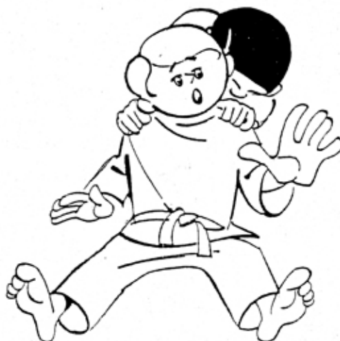
SODE - GURUMA - JIME