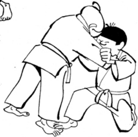
UKI - OTOSHI