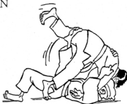
SUMI - GAESHI