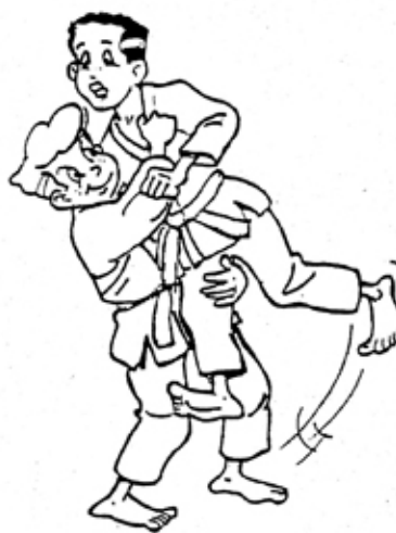
TE - GURUMA