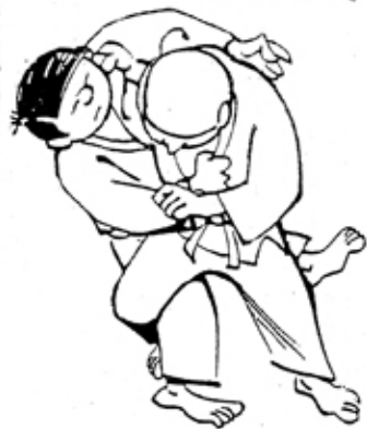
OSOTO - OTOSHI