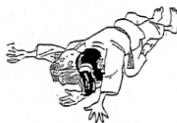
TATE - SHIHO - GATAME