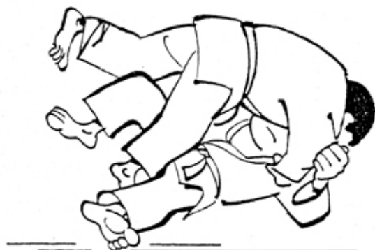
UKI - WAZA