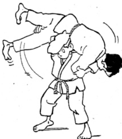
KATA - GURUMA