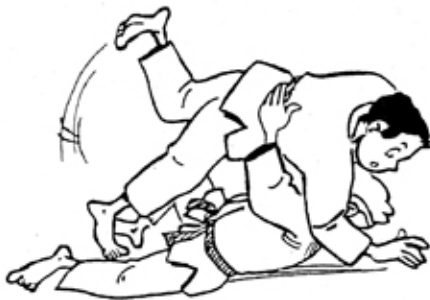
YOKO - GURUMA