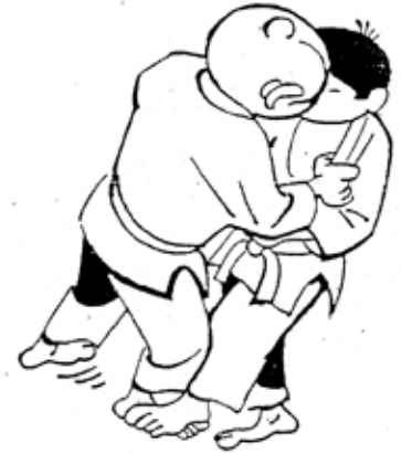
OKURI - ASHI - BARAI