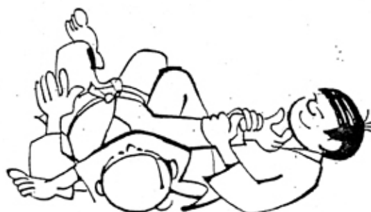
JUJI - GATAME