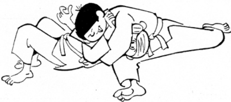
MAKURA - GESA - GATAME