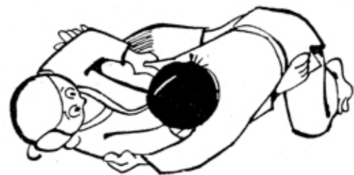
HIZA - GATAME