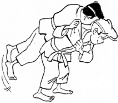
IPPON - SEOI - NAGE