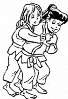
KOSHI - GURUMA