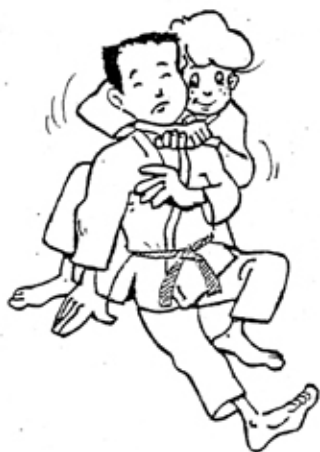
HADAKA - JIME