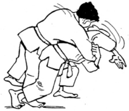
SOTO - MAKI - KOMI