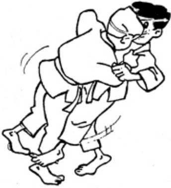
SASAE - TSURI - KOMI - ASHI