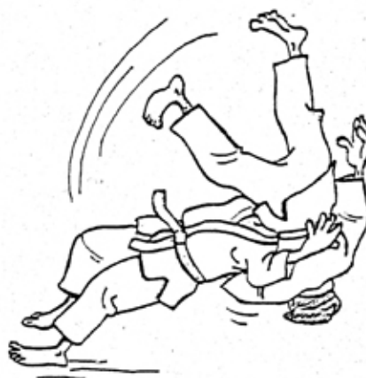
URA - NAGE