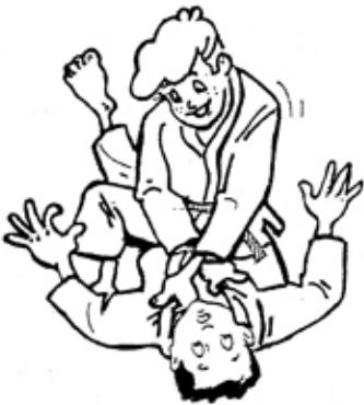
KATA - JUJI - JIME