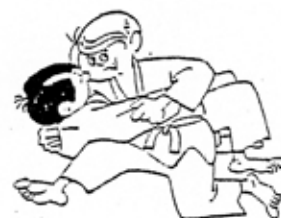
HON - GESA - GATAME