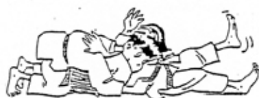
KAMI - SHIHO - GATAME