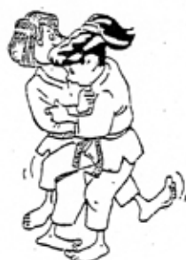
O - SOTO - GARI