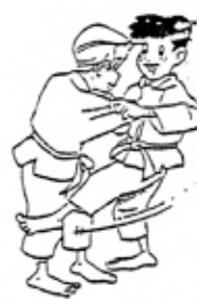
HIZA - GURUMA