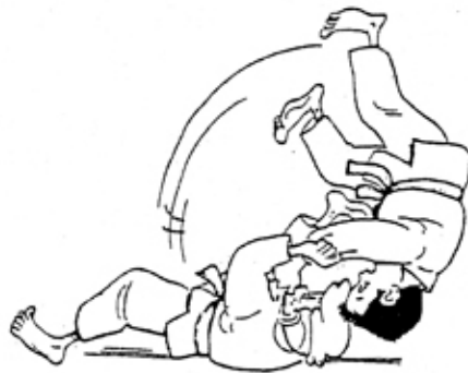
TOMOE - NAGE