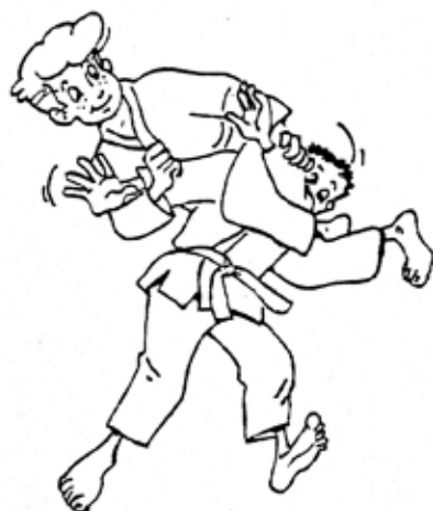
SANKAKU - JIME