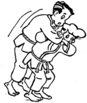
MOROTE - SEOI - NAGE